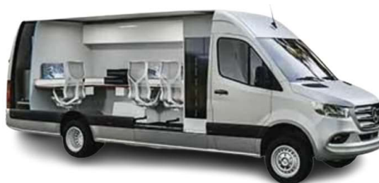
MOBILE FORENSIC VAN

The product is user configurable available in Laptop/Server/Workstation and Tablet form. It is also available with forensics tools preloaded as per the user requirement.